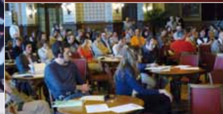
Food and sustainability network: 'Another crisis is quietly taking place... food'

investment and employee engagement in community development.' He outlined, in his lecture on 'Transforming capitalism through trust and integrity', how the $8 billion company, India's leading tractor manufacturer, is pioneering a range of bio-diesel and hybrid electric vehicles. It is also constructing 'green' buildings, including at its new R&D plant in Chennai. Meanwhile 25,000 employees have volunteered their time in community programmes, including planting more than a million trees across the country last year.