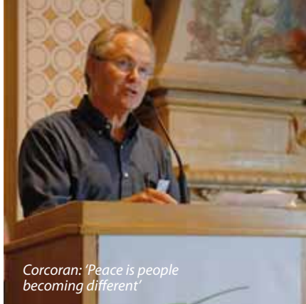
Corcoran: 'Peace is people becoming different'

Conference: Tools for Change 9-15 August, 2009