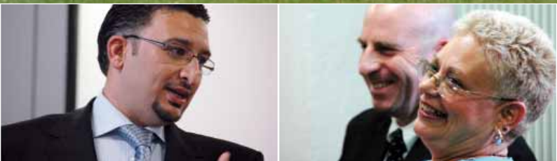
Israelis and Jordanians: partnership on water reclamation

fall back on narrow self-interest? How to respond to the 'time bomb' of climate change before it goes out of control?