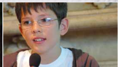
Teenagers organizing to fight climate change

new thinking, a new mind, new ideas. As a person who has been traumatized by conflict throughout my life, the level of my trauma has been reduced because I met a friend who listened to my story.'