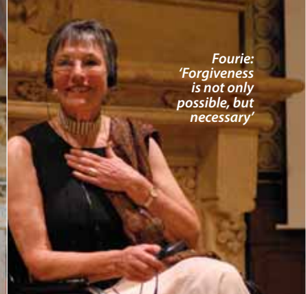
Fourie: 'Forgiveness is not only possible, but necessary'