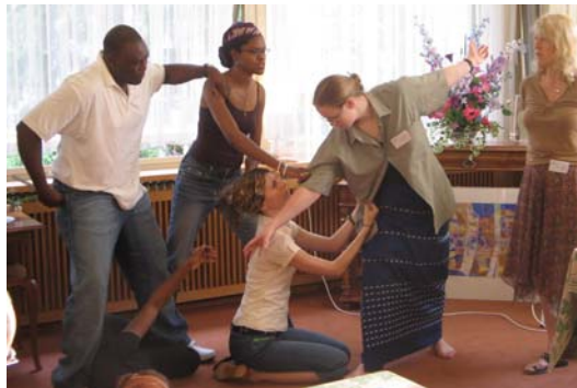
“Practicing the Arts can help us exorcise our fears, rebuild a collective identity, while providing a means to stop dehumanizing our opponent.”

And then came the news from Lebanon about the outbreak of war between Israel and Hizbollah. The front page of The Herald Tribune reported that the Lebanese Prime Minister had gone on television, “choking back tears... to plead with the UN to broker a ceasefire for his disaster-stricken nation.”