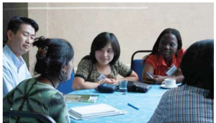
World Cafe Group

the heart of change-leadership' to being able to 'think on your feet'. 'Open space' forums were used to focus energy around particular issues and to instigate movements for change. Groups formed around initiatives to introduce a National Reconciliation Day in Malaysia, to hear the stories of indigenous peoples displaced by development and to begin Creators of Peace Circles.